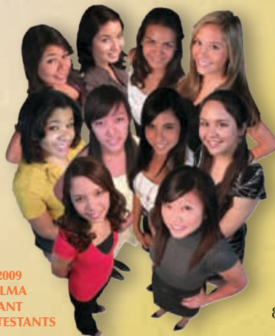
2008-2009 LA PALMA PAGEANT CONTESTANTS